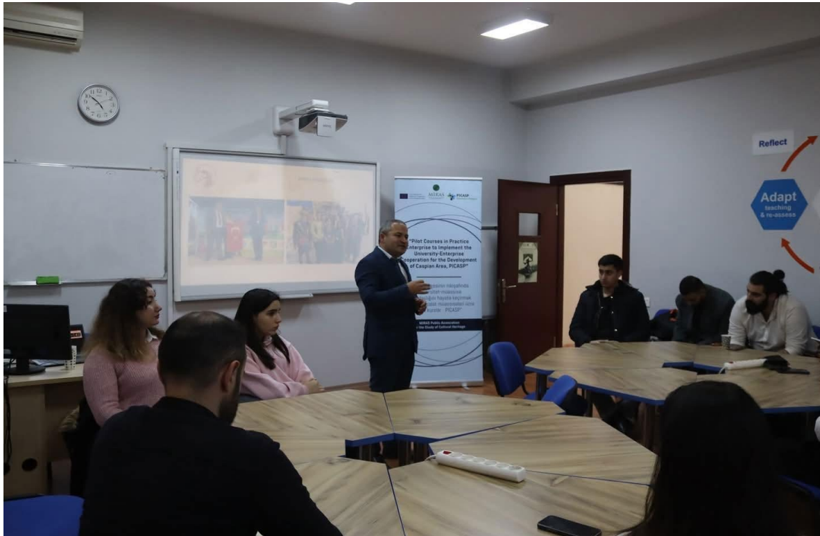
The seminar on “Cultural heritage and business”, Khazar University