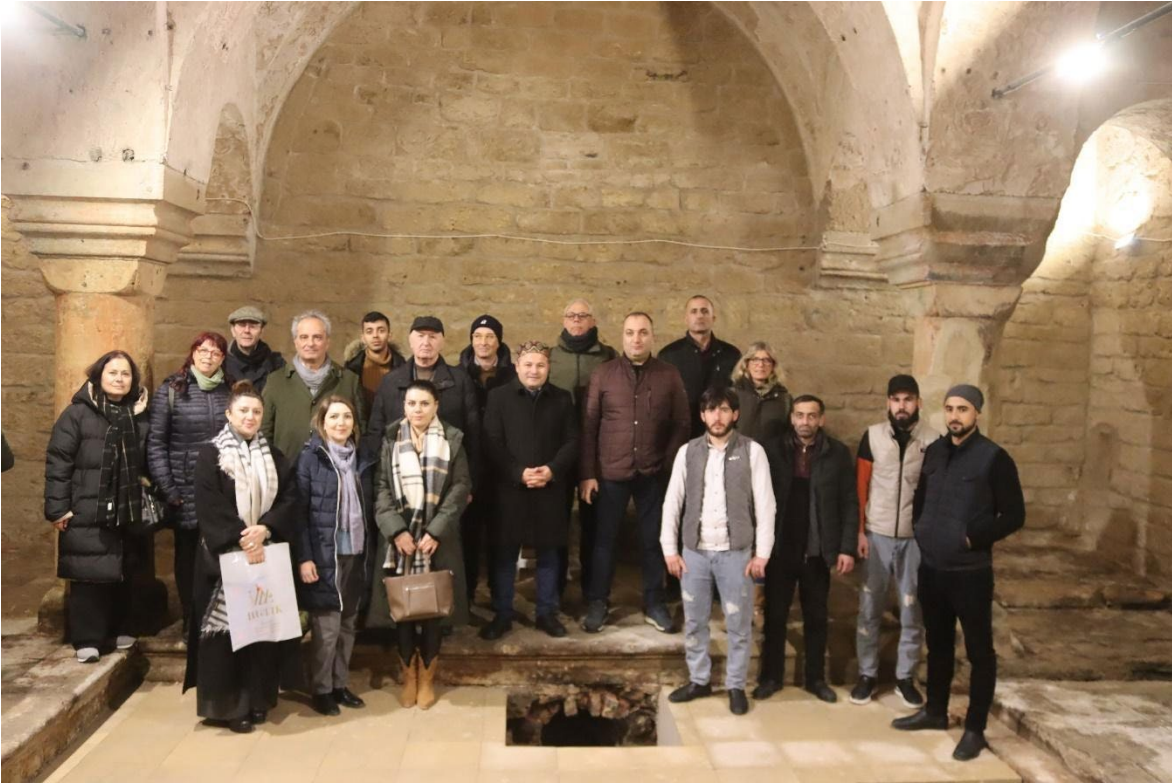
PICASP meeting at Zargarpalan Hamam (bathhouse), Baku