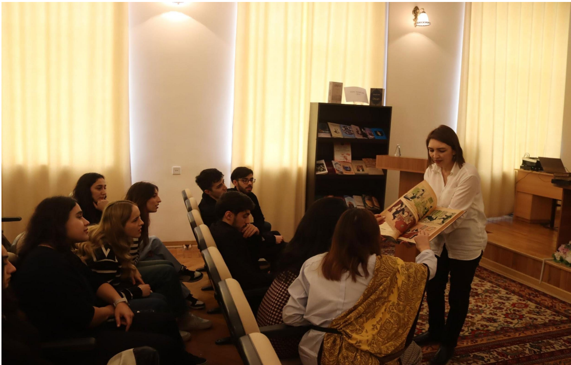
Palaeographic expedition to the Institute of Manuscripts named after M.Fuzuli of ANAS, ATMU