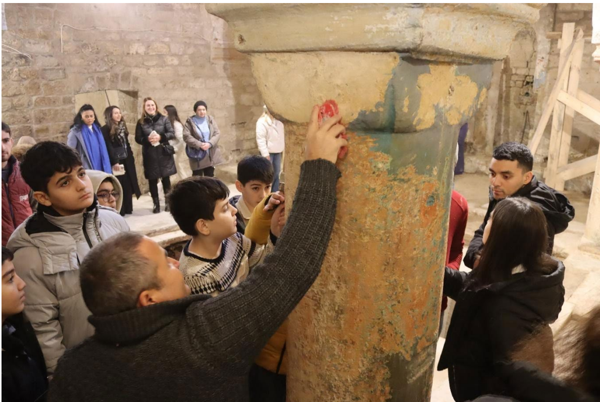
Archaeological expedition to the Zargarpalan Hamam (bathhouse)