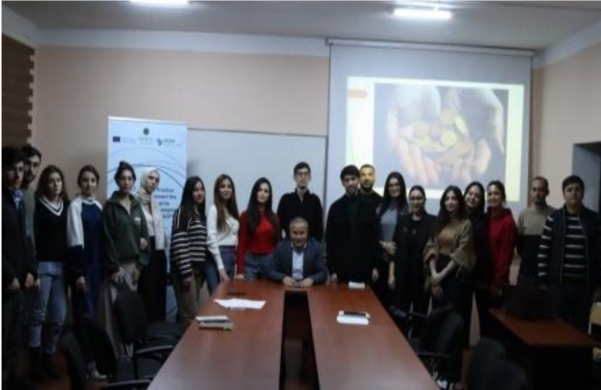
The seminar on “Museumization of Archaeological heritage”, ATMU