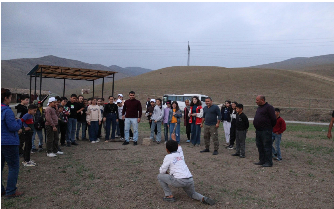
Familiarization tour to the "Terekeme Yurdu" (Nomadic settlement) folklore tourism site, S.C.Pishevari RHG