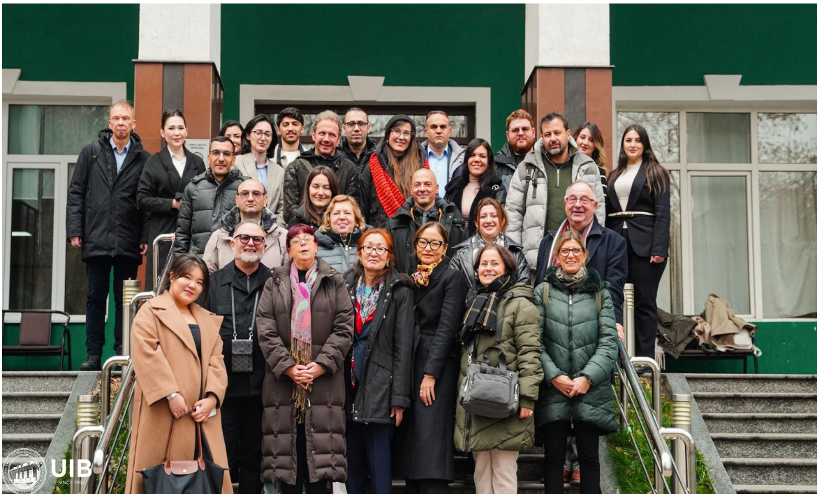
PICASP meeting, Almaty