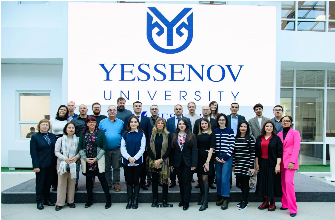
PICASP meeting, Aktau