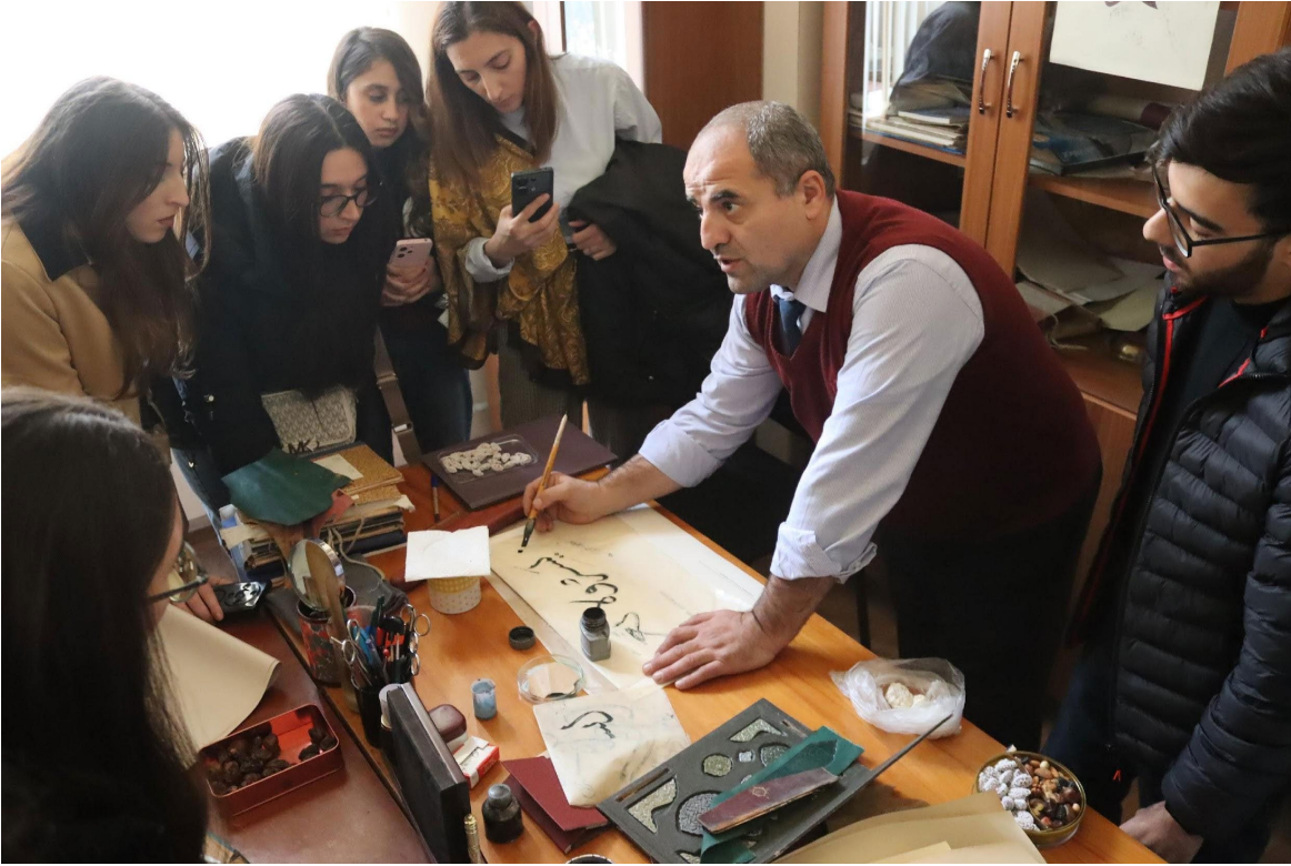
Palaeographic expedition to the Institute of Manuscripts named after M.Fuzuli of ANAS, ATMU