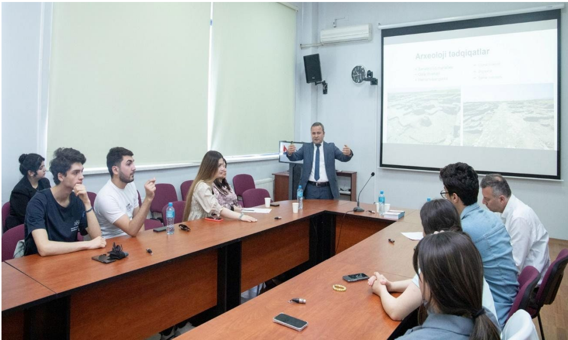
The seminar on "Organization of archaeological heritage protection", Khazar University

MIRAS also keeps bilateral relations with the different educational institutions and international organizations within the framework of the project.