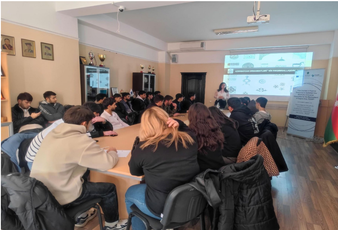
The seminar on “Digitization of Ornaments along the Northwest Tourist Route”, ATMU