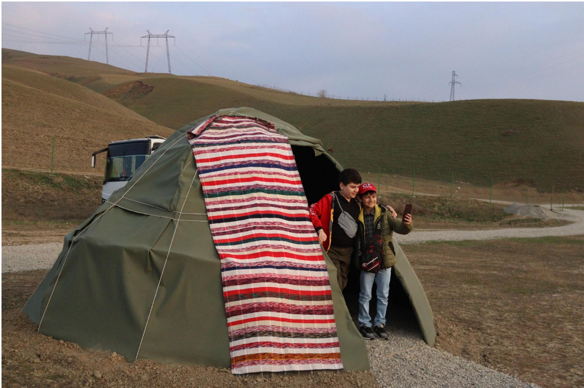
Familiarization tour to the "Terekeme Yurdu" (Nomadic settlement) folklore tourism site, S.C.Pishevari RHG