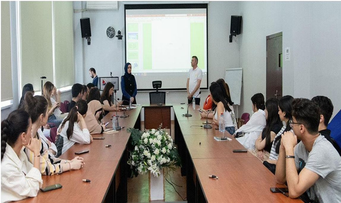
The seminar on "Organization of the tours", Khazar University