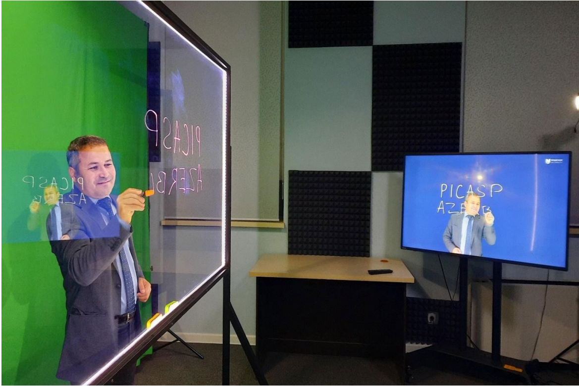
Visit to the Yessenov University, Aktau