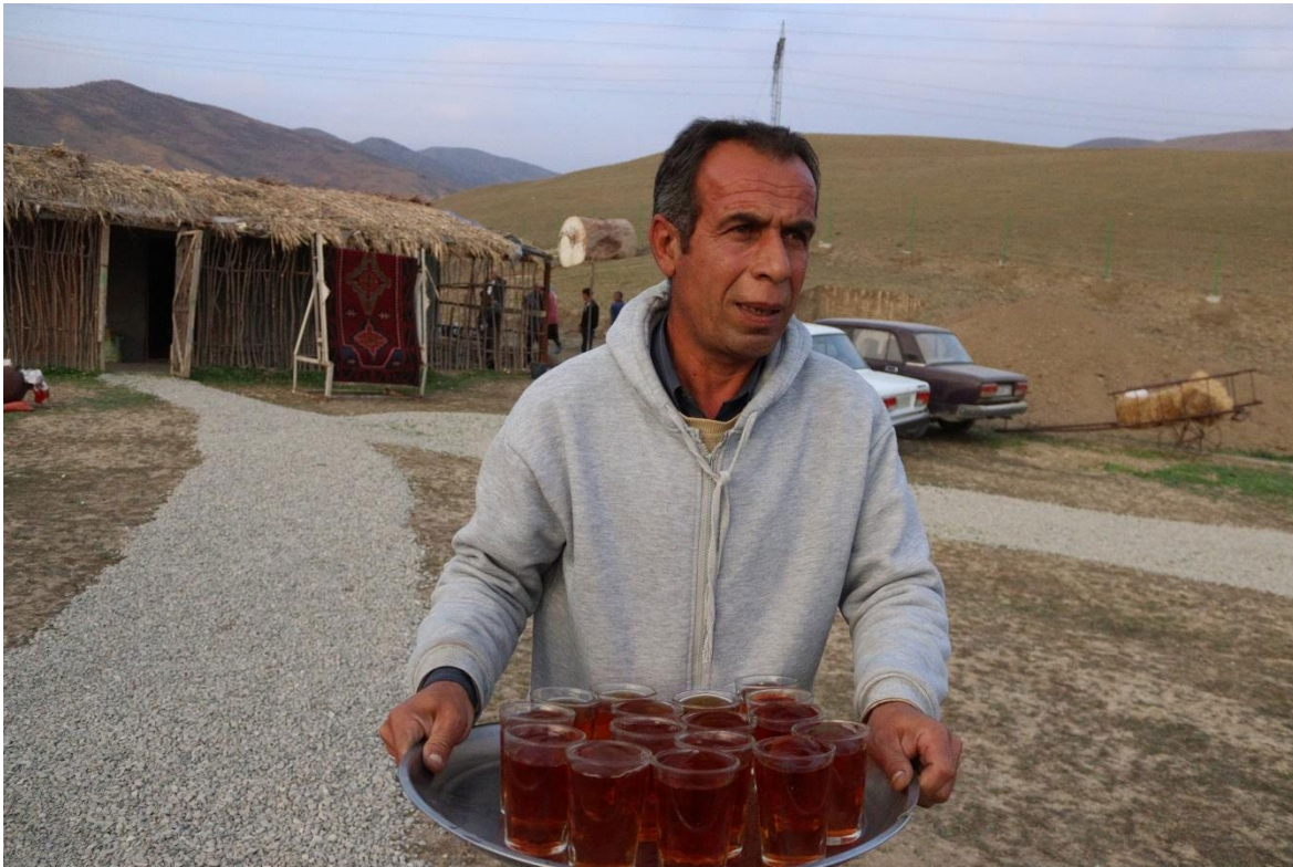
Familiarization tour to the "Terekeme Yurdu" (Nomadic settlement) folklore tourism site, S.C.Pishevari RHG