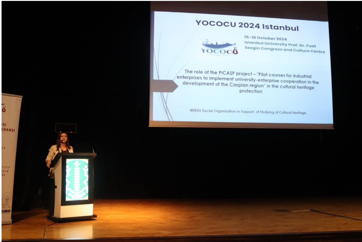
PICASP Project presentation at YOCOCU conference, Istanbul