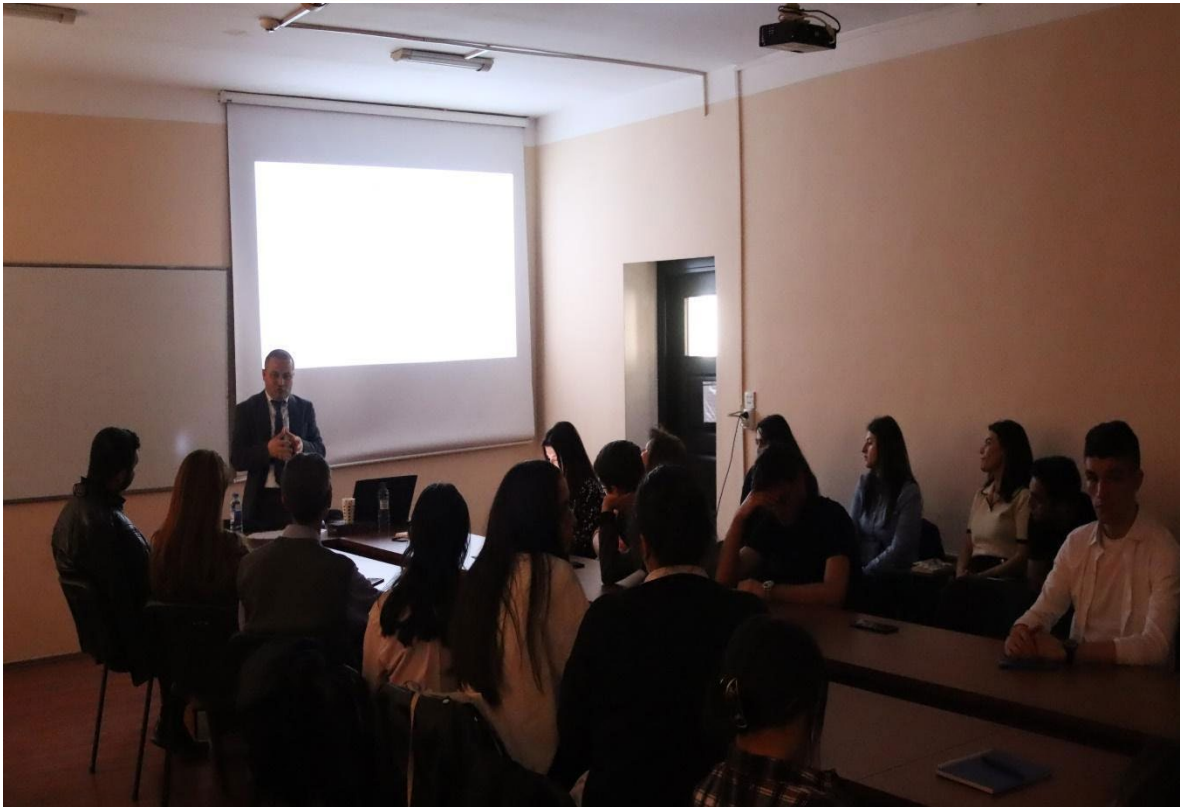
The seminar on "Archaeological heritage management", ATMU