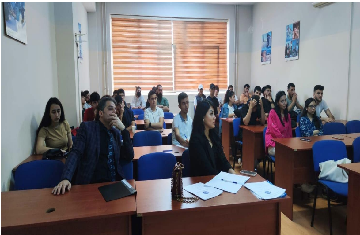
The seminar on "Organization of the tours", ATMU