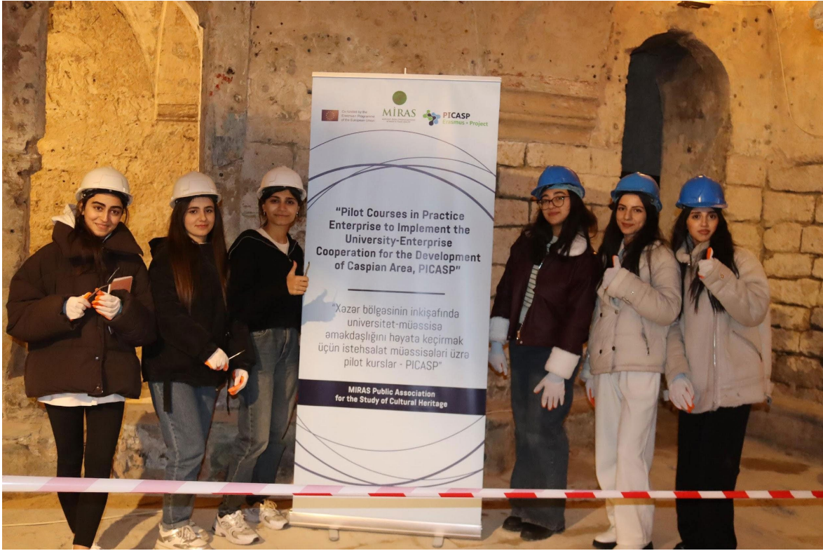
Archaeological expedition to the Zargarpalan Hamam (bathhouse), ATMU