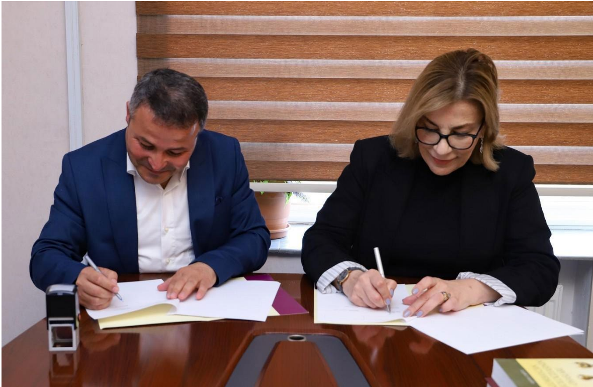
The signing ceremony of Memorandum of Understanding with Khazar University

Training of “Start and Improve your Cultural Heritage Business”, ATMU