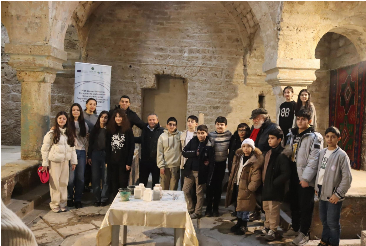
Archaeological expedition to the Zargarpalan Hamam (bathhouse)