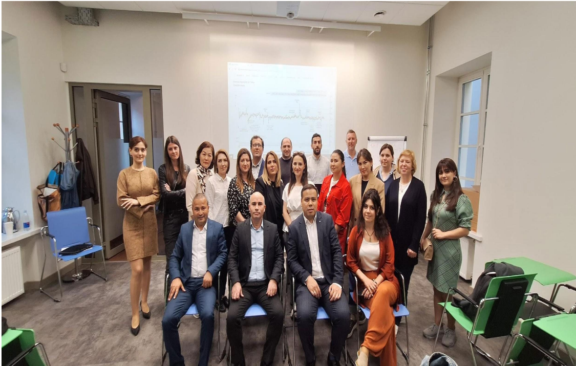
PICASP meeting, Vilnius