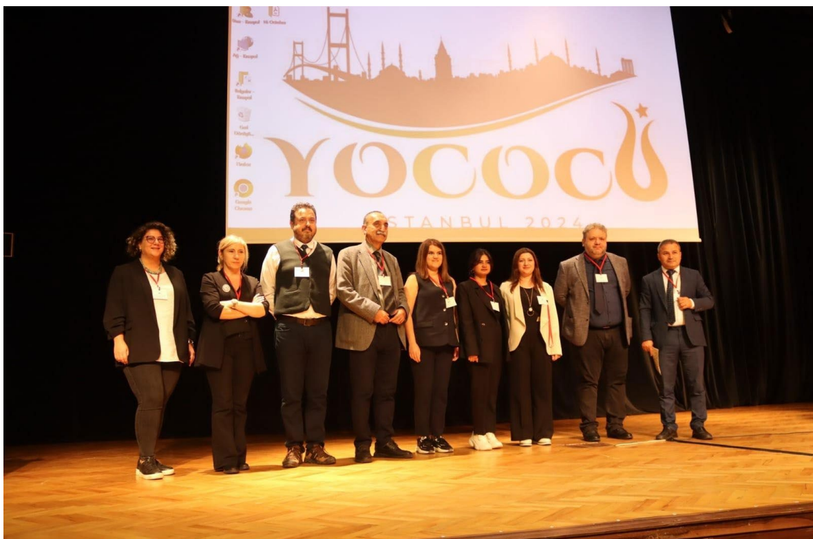
PICASP Project presentation at YOCOCU conference, Istanbul