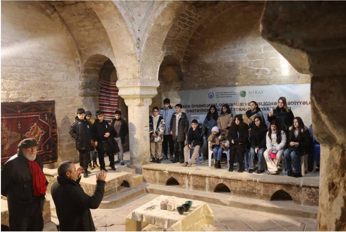
Archaeological expedition to the Zargarpalan Hamam (bathhouse)