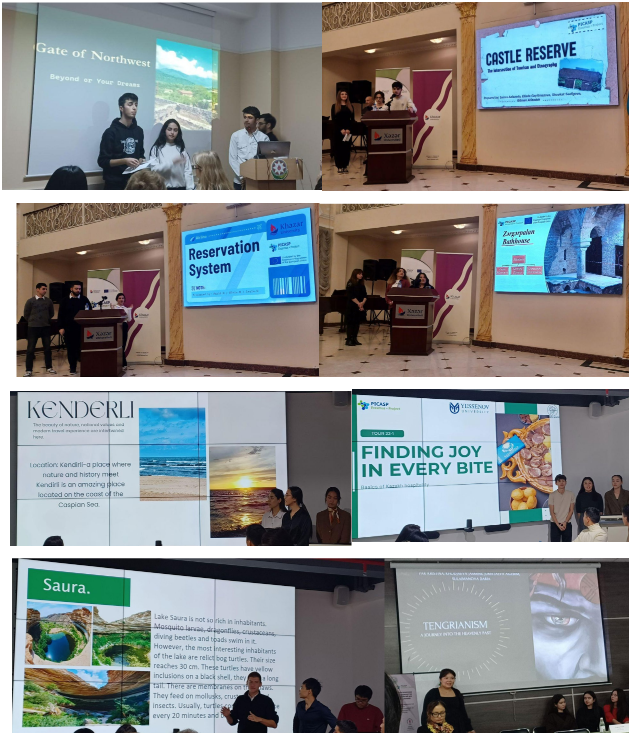
Fig.3 Students Presentation

Together with the Universities, also MIRAS association has been fundamental for the development of practical training in Cultural Heritage, as well as for developing agreements in the form of memorandum to be signed with Caspian Universities. The memorandum aims to foster the development of scientific and practical knowledge