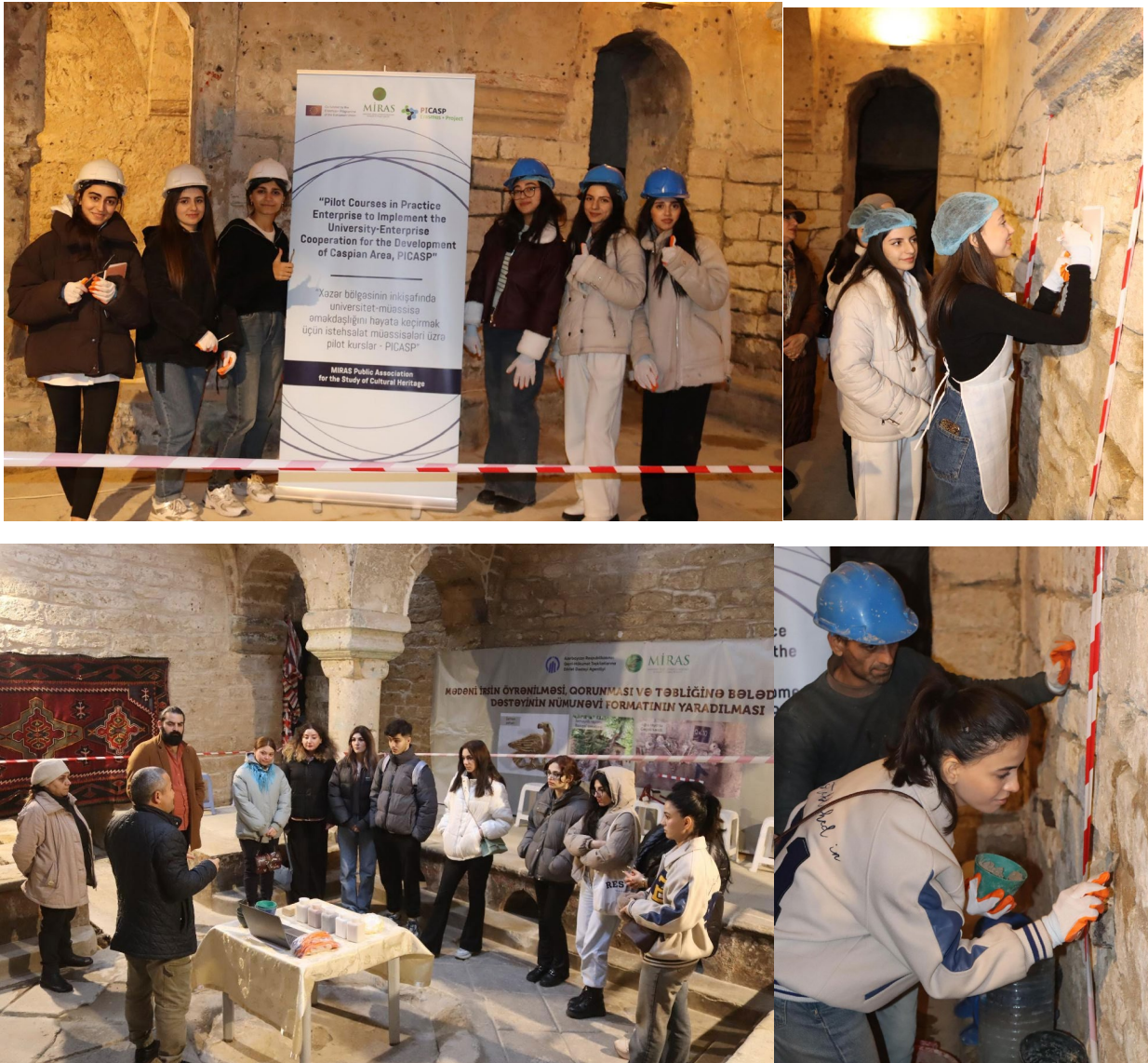
Fig.4 Archaeological expedition to the Zargarpalan Hamam (bathhouse) Atmu University e Khazar University

Thanks to these examples of memorandum, further agreements can be signed in future by MIRAS, which opened this way, and with other associations and institutions. Moreover, the agreements already existing between MIRAS and universities are now a practical base for further future collaborations in field work contributing to the sensitization of students and in the arising the local awareness and proudness for heritage, both cultural and natural. (Fig.5)